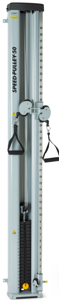
Speed pulley 50kg