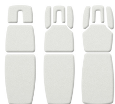
Upholstery options F3, F5, F5 hourglass

Check out the new feature videos of Capre: http://bit.ly/caprefeatures