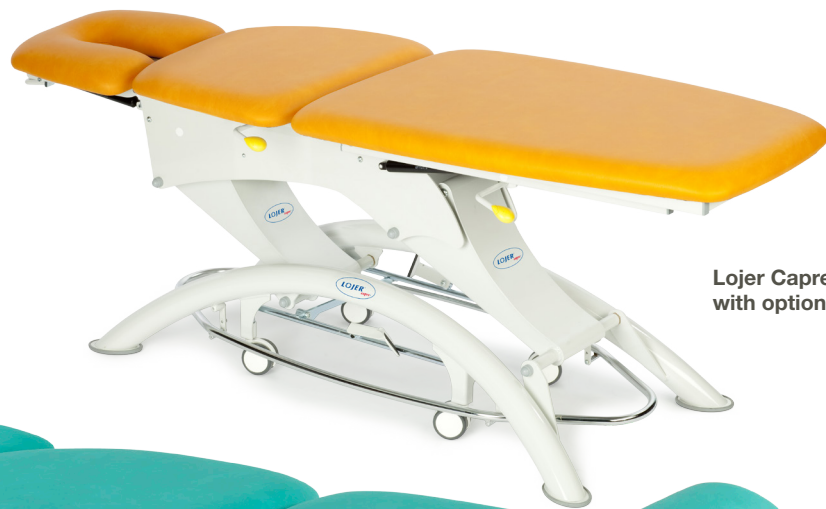
Lojer Capre F3 with optional accessories

Lojer Capre – Leading the Way in Treatment Table Safety and Design