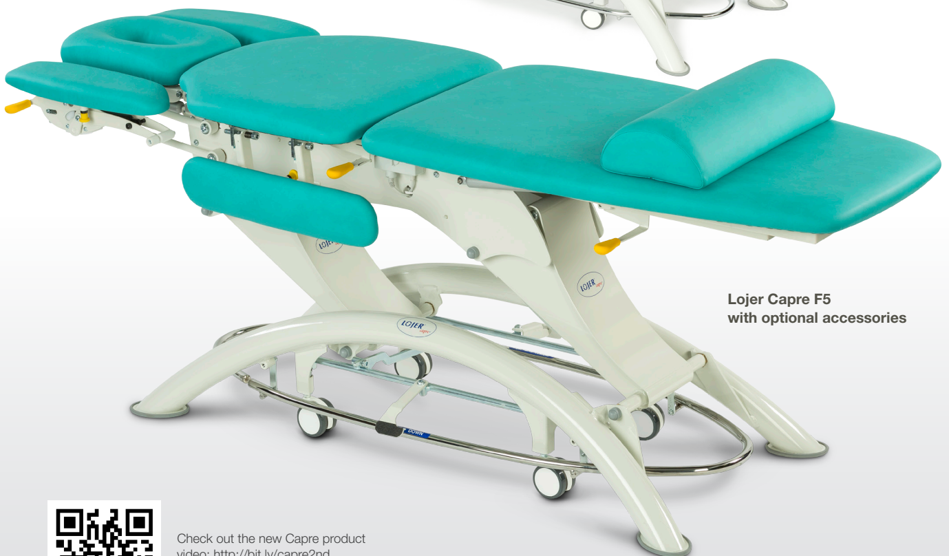
Lojer Capre F5 with optional accessories