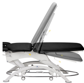
Capre F3/F5 the stepless adjustable extension and flexion angle of the footsection