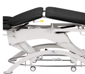
Drainage with gas spring or electric motor