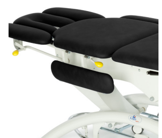
Side supports with fast locking and horizontal adjustment